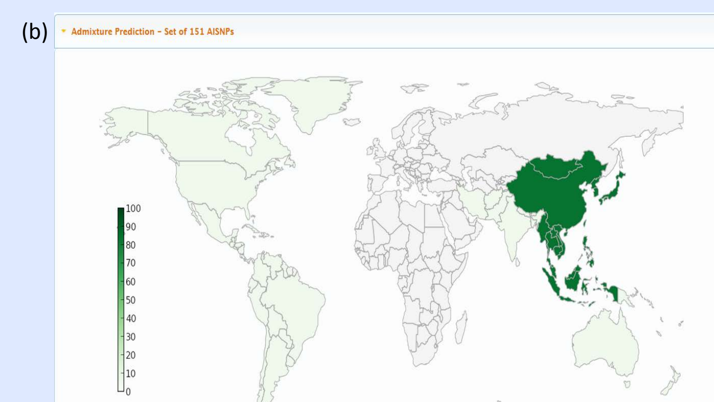
Figure 4. (a) Percentage of correct ancestry informative SNP markers called and the ancestry prediction for each sample (N = 6). (b) Geographical representation of admixture prediction for one Asian blood sample. (c) Percentage of populations predicted to be admixed within one Asian blood sample.