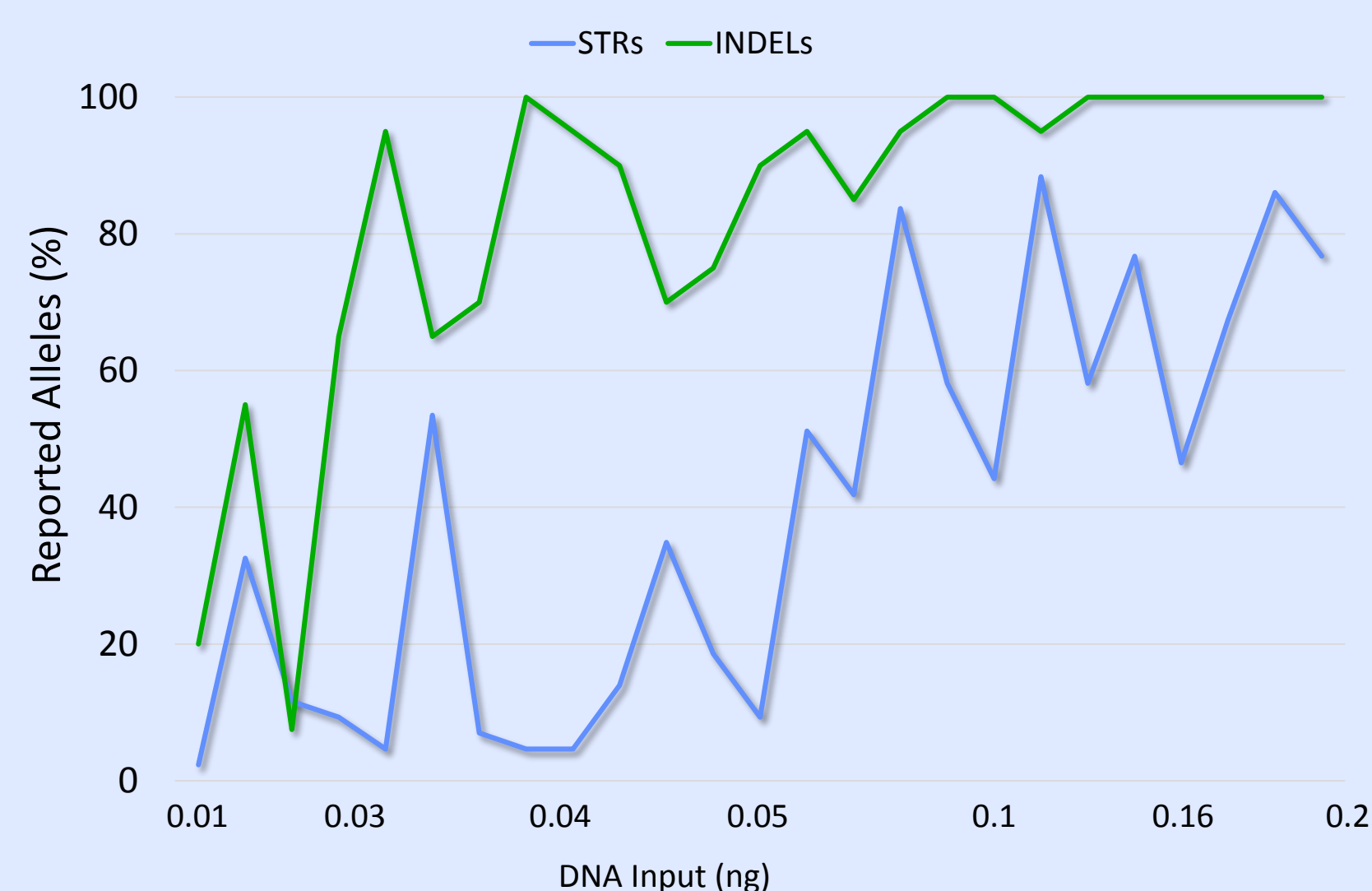
Figure 1. Comparative percentage of alleles recovered for 25 post-blast samples using STR and INDEL analyses with DNA input ranging from 0.01 to 0.2 ng.

The genotyping success of 25 post-blast samples using the GlobalFiler® Amplification Kit and the INDEL multiplex was evaluated using the number of correct alleles detected and the resulting Random Match Probability (RMP) values. In addition, the success of genotyping 7 post-blast touch samples with the HID-Ion AmpliSeq™ Identity Panel was also examined. All 6 blood samples recovered from the copper wires generated complete STR profiles, but resulted in variable ancestry prediction success via MPS.